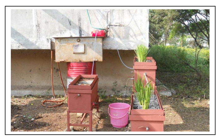
Figure 6.2 : Experimental set up of Phytorid at Tapovan

The UASB effluent did not show any foam formation after passing through the Phytorid unit.