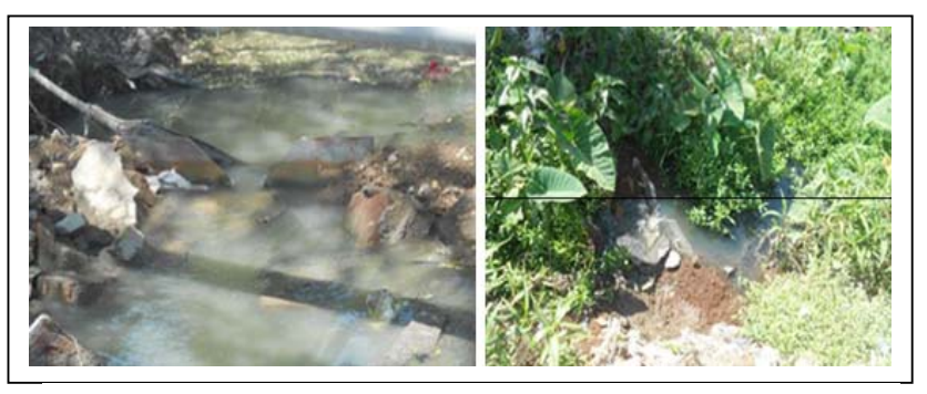
Figure 6.1 : V notch at Anandvali Nalla